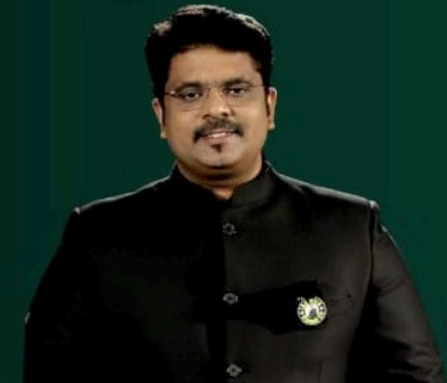
By Ojaankk Sir

Call Now For Enquiry - 8750711100/22/33/44/55